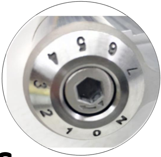
S (Spring-Deliver Closing Force)