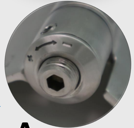
A1.A (Mechanical Buffer)