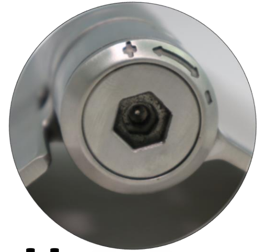
H (Hydraulic Buffer)