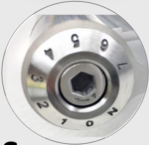
S (Spring-Deliver Closing Force)